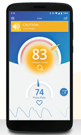
Alert 1: Caution

As oxygen levels decline, an escalating alert system* notifies the patient and their designated emergency contacts.