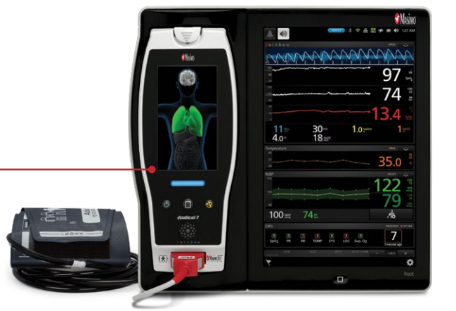
Radical-7® Handheld Monitor