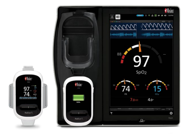
Radius-7® Wearable Patient Monitor