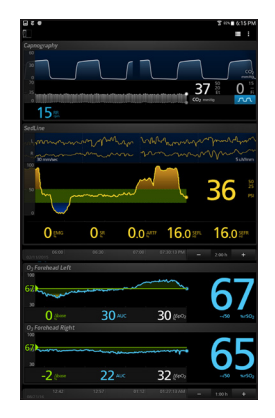
Display data from modules connected through MOC-9<sup>™</sup> ports to Root<sup> ^\circ </sup>, such as SedLine<sup> ^\circ </sup> brain function monitoring, O3<sup>™</sup> regional oximetry, or an ISA<sup>™</sup> EtCO2 module