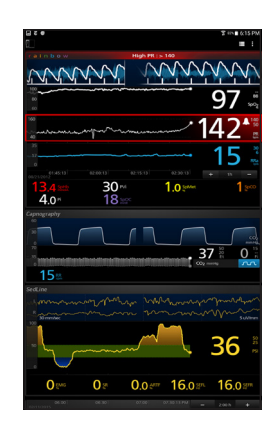
Displays visual alarms from the patient monitor, providing quick notification of changes in a patient's physiologic status

Masimo International Tel: +41 32 720 1111 info-international@masimo.com