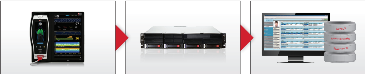
Data from Root and connected third-party devices

Integrate data from Root and third-party devices using Iris ports for automated charting in EMRs.