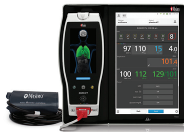
Root with Noninvasive Blood Pressure and Temperature