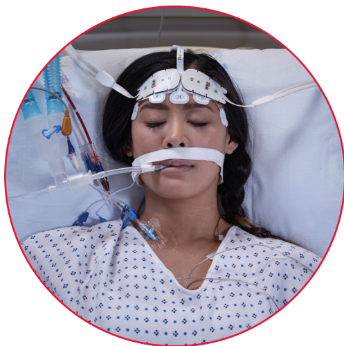
The RD SedLine sensor is designed for seamless, simultaneous application with O3 sensors

Next Generation SedLine can be used simultaneously with O3 Regional Oximetry on the Root® platform for a more complete picture of the brain.